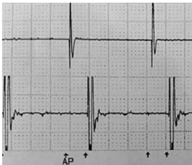
Figure 3. Electrocardiogram with sensitivity set to 0.25 mV and stimulation turned off.

Occipital neuralgia refractory to medical treatment has been successfully treated with peripheral nerve field stimulation. 1 Concerns about electromagnetic interference between stimulators used to treat chronic pain and PPMs or implantable cardiac defibrillators (ICDs) have been reported previously. 3 A literature review by Ooi et al revealed 57 unique cases, 41 of which involved PPMs and spinal cord stimulators. 4 In one case, intermittent inhibition of the pacemaker occurred with increasing stimulation amplitudes from a spinal cord stimulator, and another case reported the total reset of a deep brain stimulator's settings after delivery of a therapeutic shock from an ICD but no interference of the proper functioning of the life-saving ICD. In their conclusion, the authors suggested that PPMs and neurostimulators can be used together safely, but their review did not include any reports of peripheral nerve field stimulation interactions with PPMs.