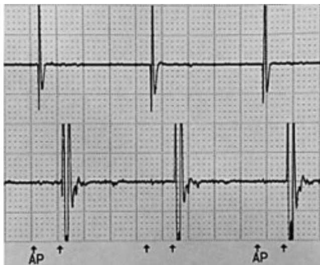
Figure 4. Electrocardiogram with sensitivity set to 0.25 mV and stimulation turned on.

While the implantation of neuraxial spinal cord stimulators in patients with PPMs increasingly can be done safely with proper planning and testing, the extent to which peripheral nerve stimulators electrically interact with PPMs is unclear. In contrast to spinal cord stimulators that place leads in the epidural space and tend to locate the generators in subcutaneous tissues at the level of the lumbar spine, our peripheral nerve field stimulator was implanted in the same plane of tissue as our patient's PPM and the leads for the 2 devices were proximate.