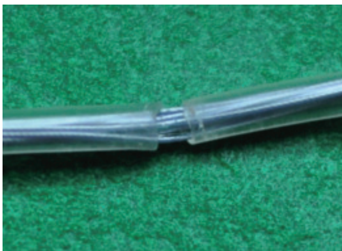
Figure 2. Close up view of the exposed internal wires at the site of insulation disruption.

tunneled from the fluoroscopic view of the dens along the occipital ridge, superiolaterally, to the inferiolateral border of the left orbit projection, utilizing a 14-gauge Touhy needle. Intraoperative testing was performed, which yielded excellent coverage of the patient's headache and no return of the previous aggravating symptoms. The lead was anchored to the fascia using 2-0 silk and a butterfly anchor. A 1 cm left paramedian incision was then made and the lead was tunneled from the cervical area to the superior gluteal region where the implanted pulse generator was re-exposed, the old lead removed, and the new lead connected. All surgical incisions were then closed and the patient was taken to the recovery room. One hour following the procedure the patient reported excellent analgesia and again denied having the muscle spasm or burning sensation. Stimulation settings were again set to 00+--+00, frequency 120 Hz, pulse width 280 \mu sec. The settings were maintained before and after revision.