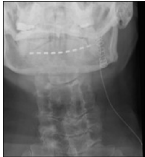
Figure 3. Occipital nerve stimulation for bilateral occipital neuralgia.

zero, respectively, for patients with ON. Patient with CM had 80% reduction in frequency of attacks from five to one per month. Over the follow-up period, there were no episodes of lead migration or revision.